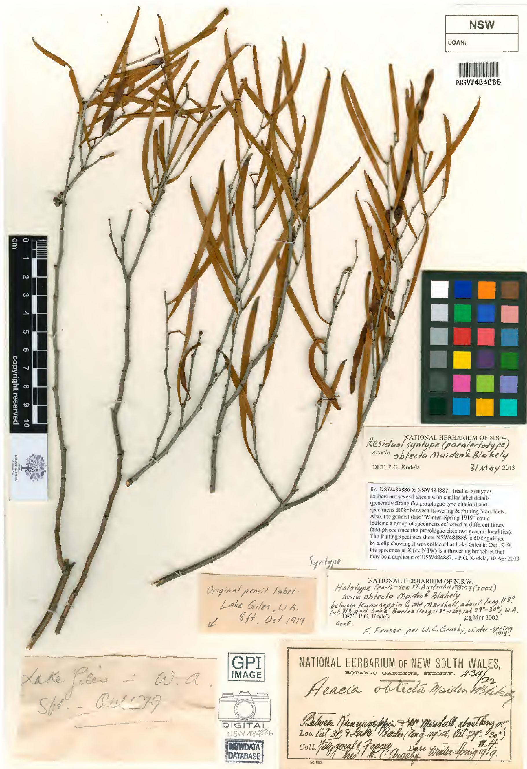
Fig. 4. Residual syntype of Acacia obtecta Maiden & Blakely, NSW484886